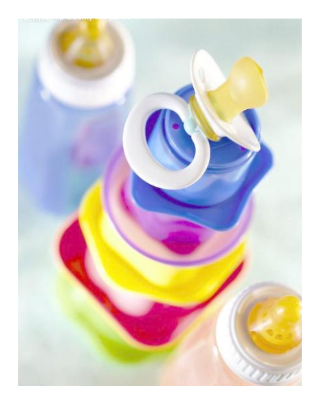
Further Information: OFHHA Notice